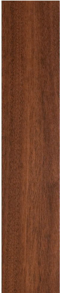
LT 1181 Honduran Mahogany