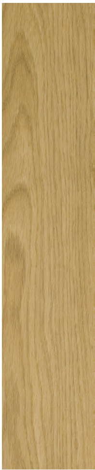
LT 1142 Golden Oak