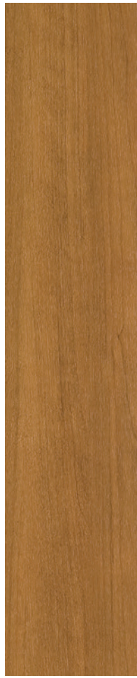
LT 1151 American Cherry