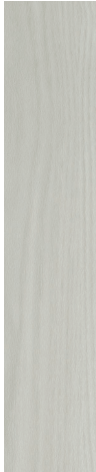
LT 1131 Smoked Ash