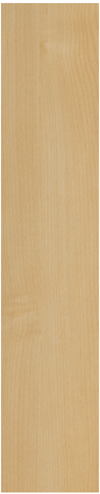
LT 1122 Canadian Maple